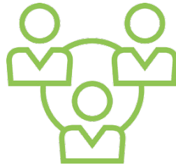
GROW IN COMMUNITY